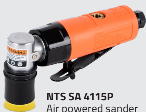
NTS SA 4115P Air powered sander small areas APP No. 139210