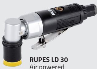
RUPES LD 30 Air powered mini sander APP No. 131110